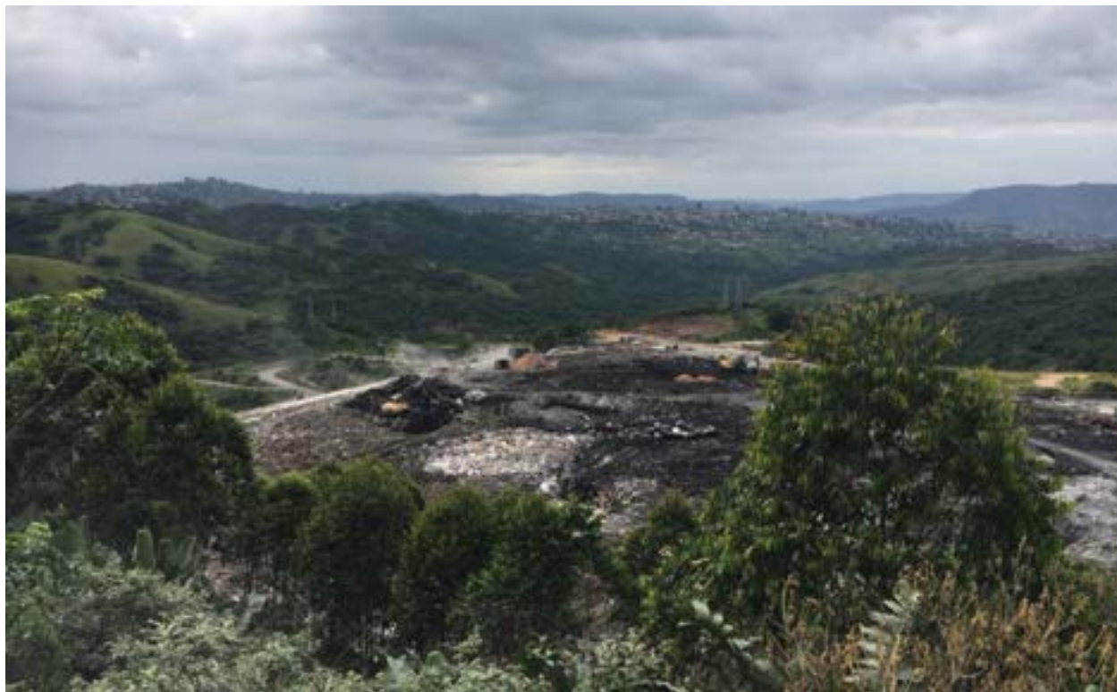
The Shongweni EnviroServ Landfill site, the thorn in the foot of the Shongweni community.

made in September 2016, when people of south Durban, in solidarity with the people of the area around the Shongweni site, voiced their discontent caused by EnviroServ dumping millions of litres of toxic leachate via the southern sewage treatment works sea outfall. They stated that: