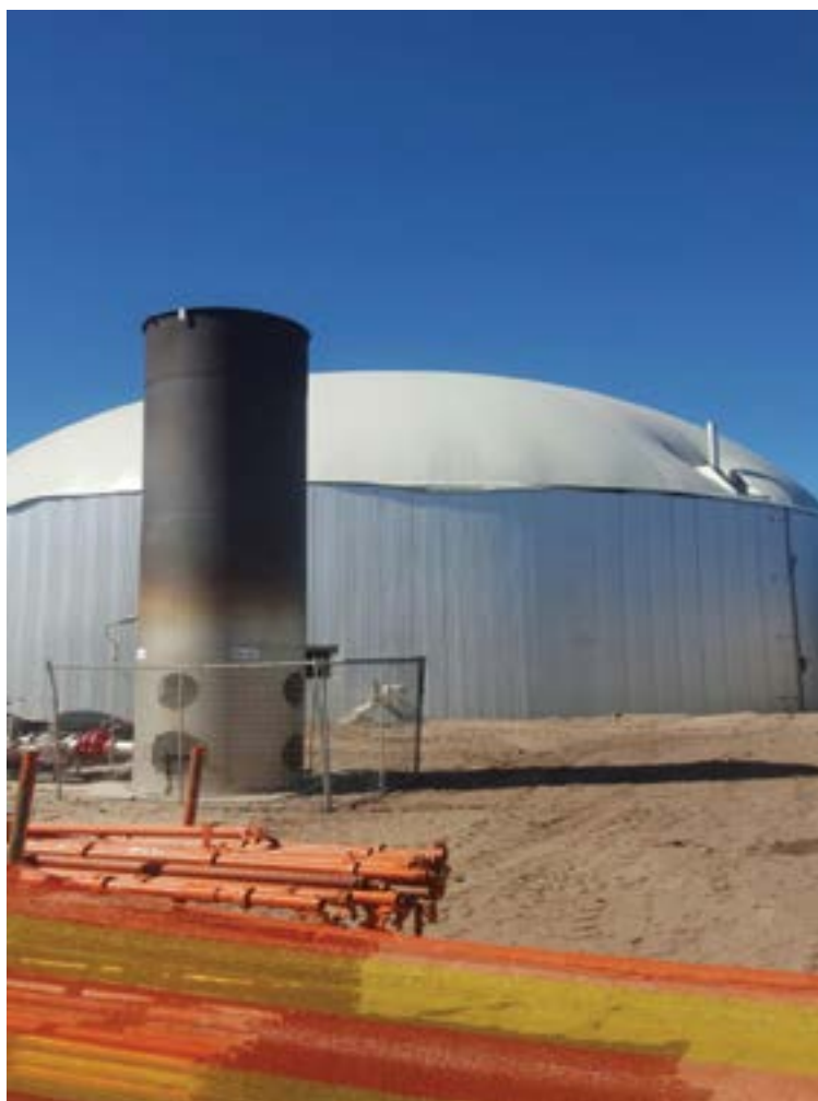
Athlone tank that waste is deposited into to make gas

The biodigester plant is hope for this country, proving that we can do things differently and in an environmentally sound manner: in a manner that would create jobs and protect the environment. The gasification plant and incinerators kill that hope. Thanks to Industrial Development Cooperation (IDC) for funding Clean Energy Africa to implement the biodigester project. We hope there are many lessons to be learned from this project. This project can be replicated in other parts of the country and it can also be improved upon, not through gasification but through zero waste and by having separation at source, reduce, reuse and recycle cooperatives of waste pickers. ✎